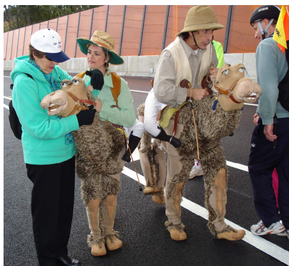
Sometimes we come across some strange things on our rambles.

Already, we are planning next year's Rambling. Just a reminder if you want