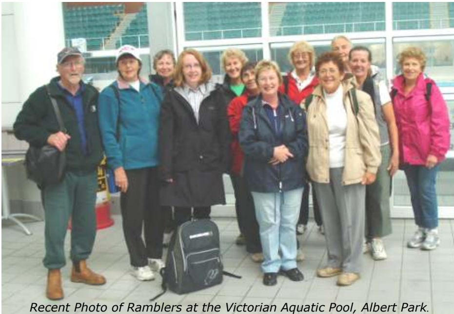
Recent Photo of Ramblers at the Victorian Aquatic Pool, Albert Park.

surprised how the walk pontoons have been added to one side of the River giving us a different view of the area. As normal, we had our lunch after the main walk, sitting all in a row on the softball team bench looking across the many ovals and watching the passing parade. Then, onto a tram to Malvern to catch the train back to Frankston. Some of us had a nice stroll along Glenferrie Road Shopping area. Very different to our local shops.