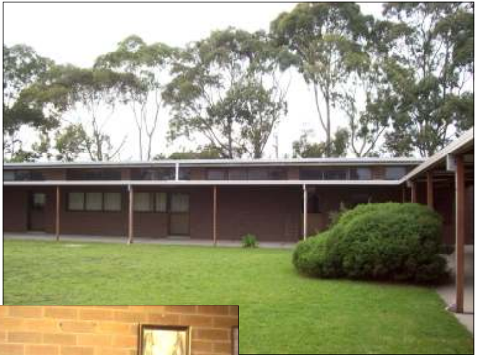
Above: Classrooms facing the grassy quadrangle.